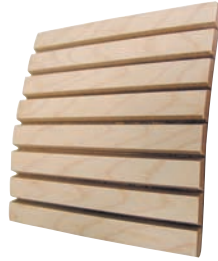
Wood veneer MDF slats